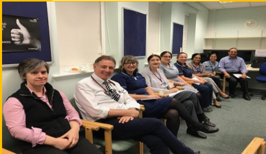
County Durham and Darlington NHS Foundation Trust