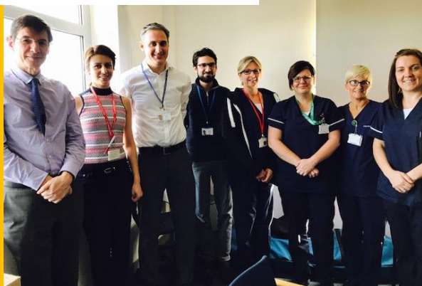
South Tees Hospitals NHS Foundation Trust